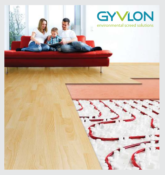
THERMIO+ IS A TECHNOLOGY PATENTED BY GYVLON®